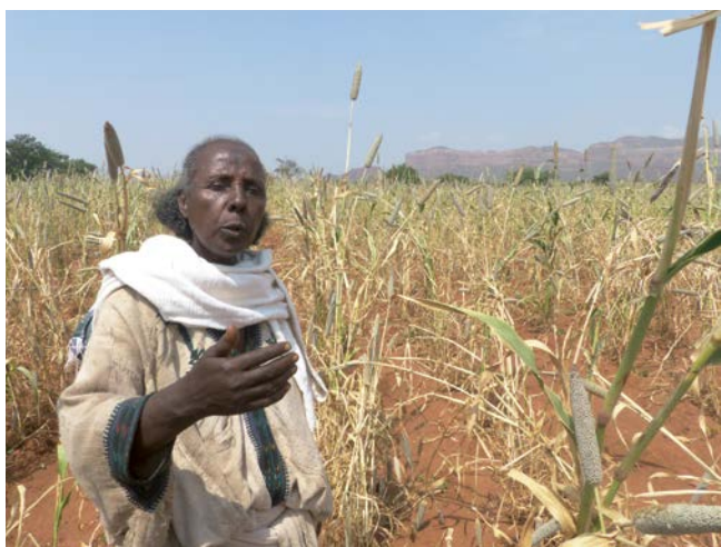
A woman-headed household with drought tolerant crop of pearl millet in Abergele, Wag-Himera Zone (2017)

Agriculture in Ethiopia, the main source of income for more than 80% of the country's population, is characterized by small-scale production patterns. As 95% of agriculture in Ethiopia is rain-fed, strengthening the adaptive capacities of small-scale farmers to deal with variable rainfall has become vital. Even under "normal" conditions, about 10% of the population cannot meet its basic food needs and instead relies on food assistance (ASSAR 2015, EPCC 2015). When taking into account the projections for Ethiopia – an expected rise in temperatures, an increase in the unpredictability of rainfall, and an uptick in the frequency and intensity of extreme events – a true sense of urgency for climate action is required (Agriculture Future 2013; World Bank 2010, UNDP 2008).