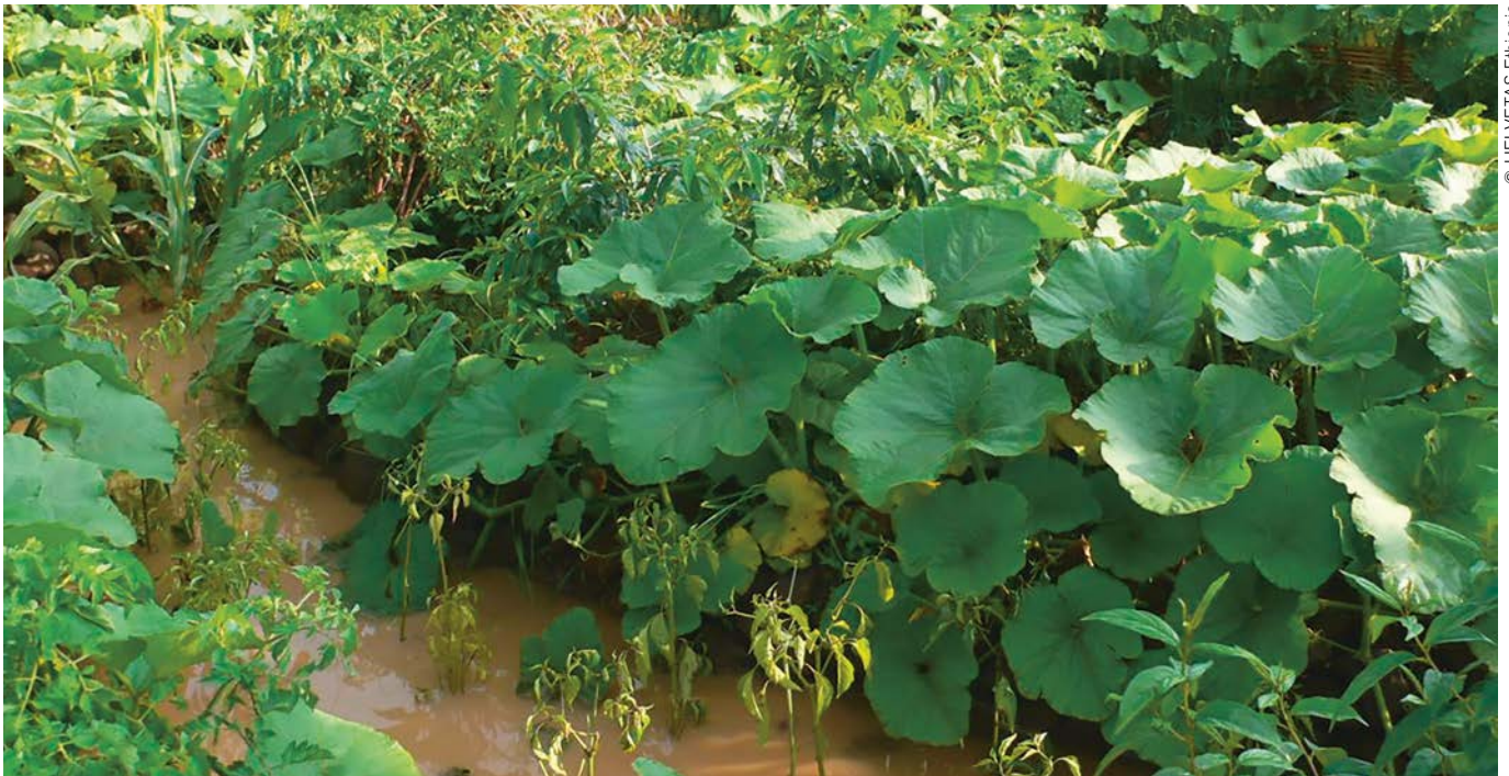
Ring-basin infiltration pit during the driest month in Dehana woreda, Wag-Himera Zone (2014)