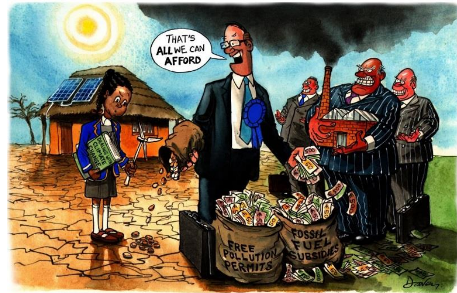
PARIS CLIMATE DEAL: LEADERS DECIDE ON WHO NEEDS MOST SUPPORT