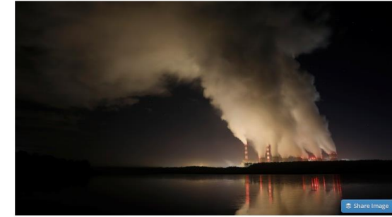
Smoke and steam billow from Belchatow Power Station in Poland, the site of the UN's 2018 climate conference.