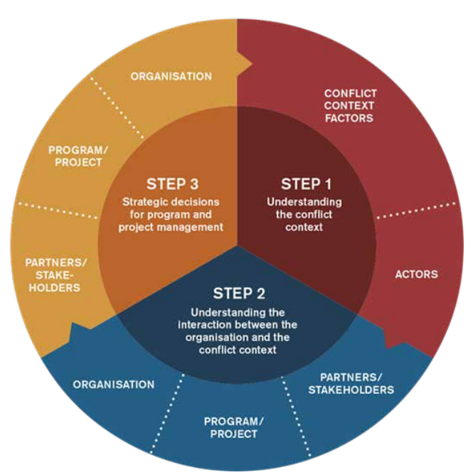
Figure 1. Conflict Sensitive Project and Programme Management (Helvetas)

Helvetas' approach to conflict sensitivity has been guided by the manual <u>3 Steps for Working in Fragile and Conflict-affected Situations</u> (see Figure 1). Conflict sensitivity is defined as the ability of an organization to 1) understand the context in which it is operating (including intergroup tensions, the divisive issues and those that have the potential to strengthen social cohesion); 2) understand the interaction between its intervention and that context; 3) act on that understanding to avoid exacerbating a fragile and conflict situation and instead strengthen local capacities for peace.<sup>2</sup>