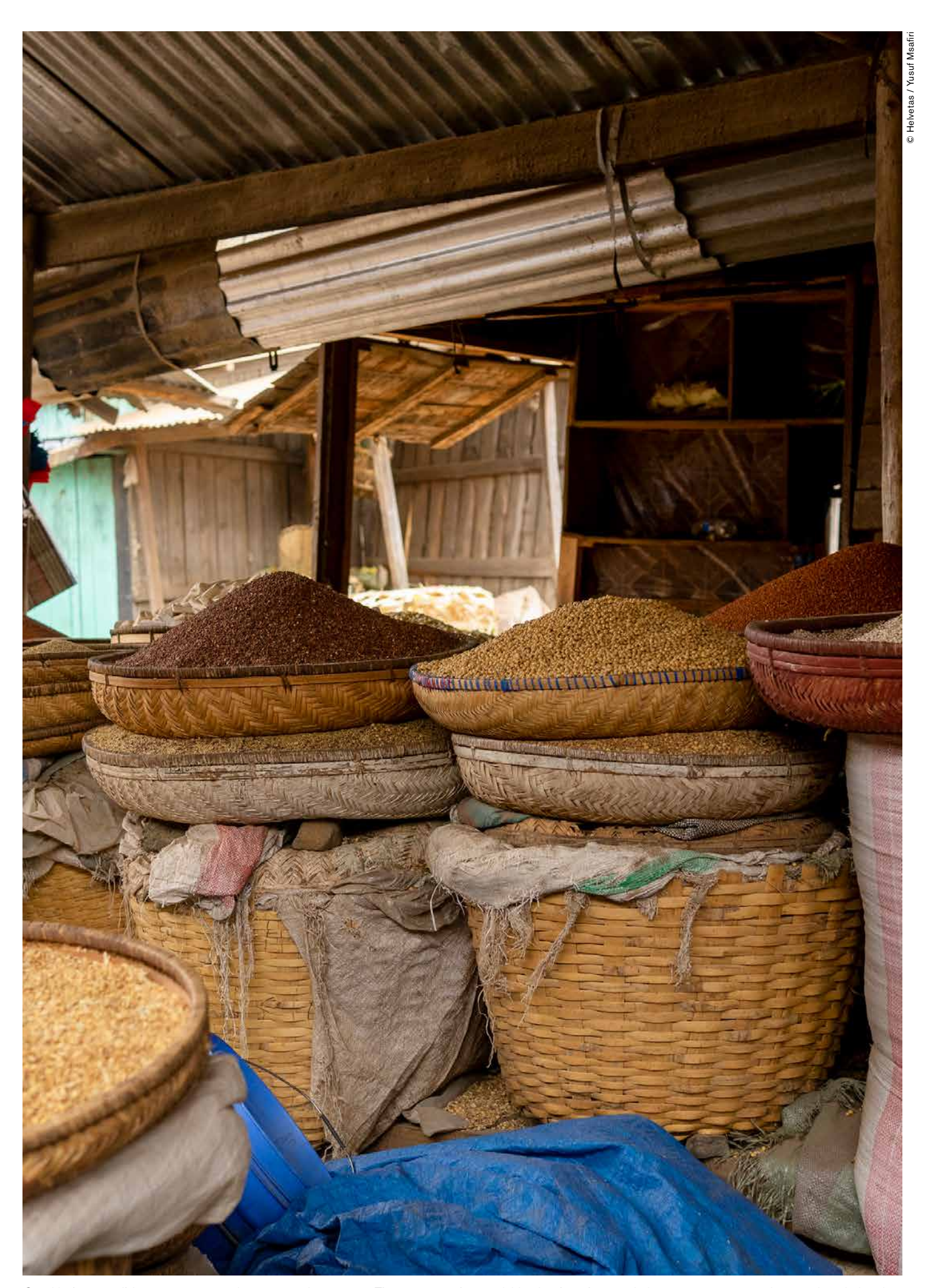
One kind of possible effect of our actions are market effects. These occur when activities lead to changes in incomes, wages, profits, or prices in local markets, potentially sparking or aggravating tensions.