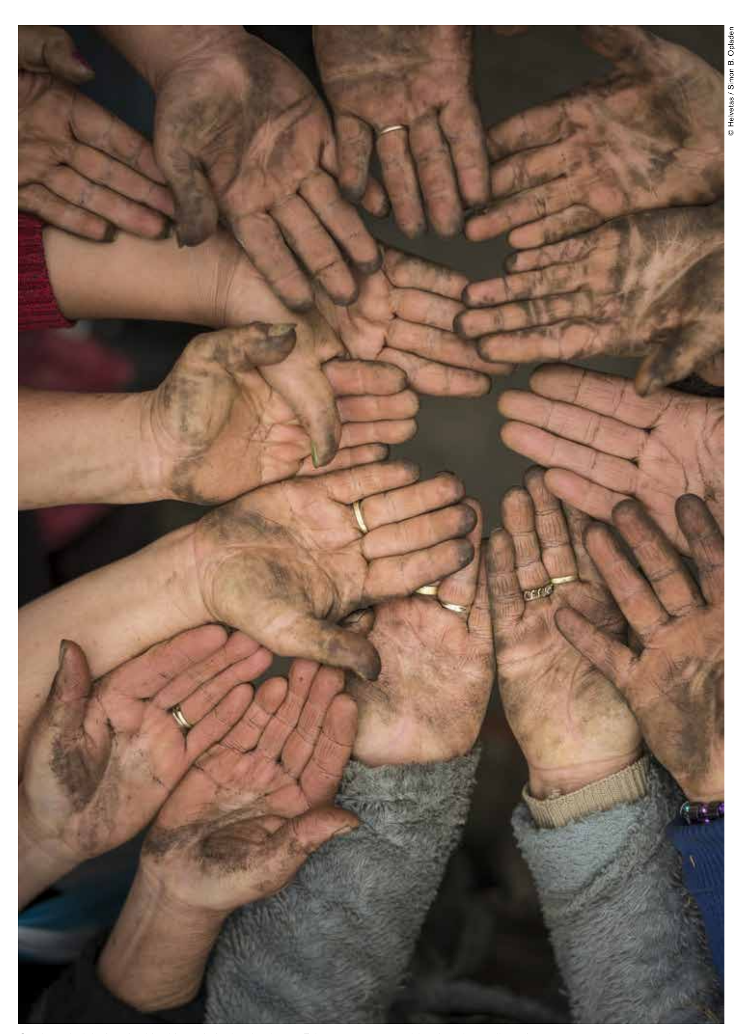
One key principle that should guide our behaviour is fairness. Fairness means recognizing the value of all members of a community and ensuring that not only the concerns and interests of powerful groups or individuals are heard and acted upon.