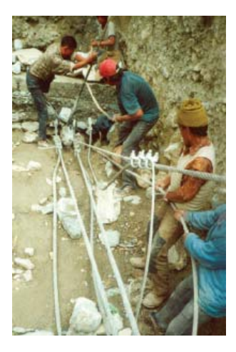
Suspension bridge construction training by Nepalese technician to Burundian technicians, top; cable pulling in Nepal, bottom.

sibility study and designed some bridges at the request of the Burundian Government. In 2014, HELVETAS Swiss Intercooperation successfully completed the construction of seven bridges in Burundi: two steel truss, two suspended, and three suspension. The Burundi Project had been launched through a tripartite agreement between the Road Department of the Government of Burundi, African Development Bank, and HELVETAS Swiss Intercooperation. A team of seven experts from Nepal were deployed to implement the project. User committees were engaged in construction to enhance their know-how of bridge building and maintenance. Fabricated steel parts and wire ropes were not available in/around Burundi and thus were transported from Nepal and India. Design training for Burundian engineers is expected to take place in 2015 in Nepal. There appears to be an enormous need for trail bridges in Burundi. An exploratory trip has been planned for the winter of 2015.